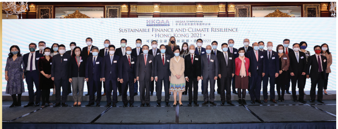
Group photo with leaders and representatives from the banking and financial institutions. 主要嘉賓與銀行和金融機構領袖及代表合照。