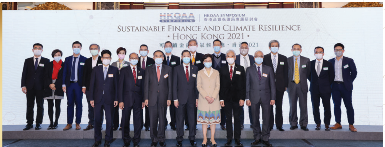
Group photo with leaders and representatives of Green and Sustainable Finance Issuers in the public utilities, industrial and commercial sectors. 主要嘉賓與公用事業及工商界的綠色和可持續金融發行機構領袖及代表合照。