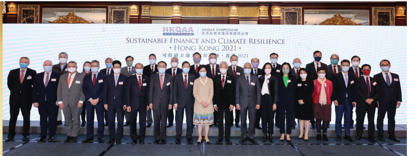
Group photo with HKQAA Governing Council members, Green and Sustainable Finance Certification Scheme Technical Committee Members, guest speakers, and leaders from government departments, regulatory organisations and others renowned organisations in the financial sector. 主要嘉賓與香港品質保證局董事局成員、綠色和可持續認證計劃技術委員會成員、演講嘉賓，以及來自政府部門、監管機構和業界知名組織的領袖合照。