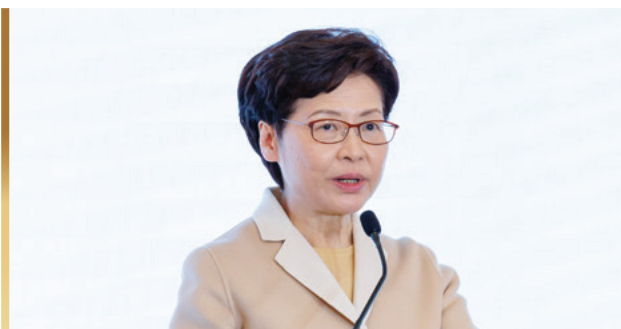
Mrs Carrie Lam Cheng Yuet-ngor 林鄭月娥女士